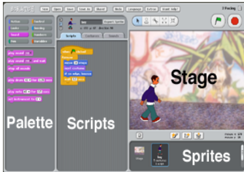
Figure 1. Screenshot of the Scratch User Interface

were the less obvious concepts of variables, Boolean logic, and random numbers. Chi-Square tests were used to analyze differences in the percentages of projects containing targeted programming concepts from Year 1 to Year 2 (see Figure 2). Overall, four of the seven programming concepts (Loops, Boolean Logic, Variables, and Random Numbers) demonstrated significant gains in the number of projects utilizing the targeted concepts ( p < .001 ). One of the remaining concepts (Conditional Statements) had marginal gains ( p = .051 ) and one concept (Communication/Synchronization) demonstrated a reduction in the projects utilizing this concept.