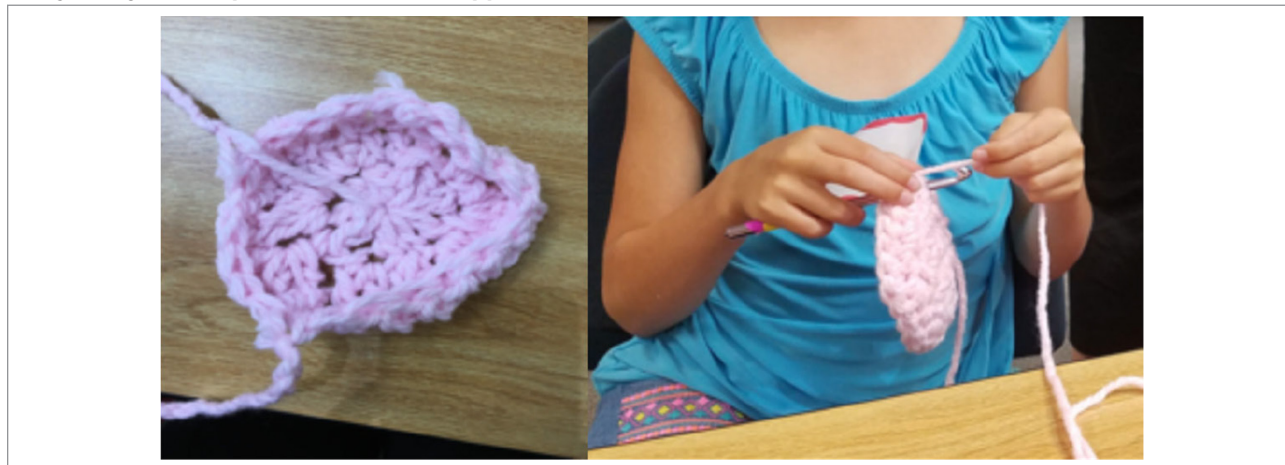
FIGURE 1 Tracy’s Project (Adapted from Keune & Pepler, under Review)

Did identifying the pattern in her neighbor’s project and knowing how to create a “relationship” between the initial pattern to multiplicatively scale the project signal that Tracy had learned and applied the concepts of multiplicative proportional reasoning? We analyzed the relationships involved in the nested expansions of her three-row-wide flat circle (see Figure 3, left). Row one was a magic circle with 6 stitches, row two had a circumference of 12 stitches, and row three had a circumference of 18 stitches, producing a 1/6 = 2/12 = 3/18 relationship, which