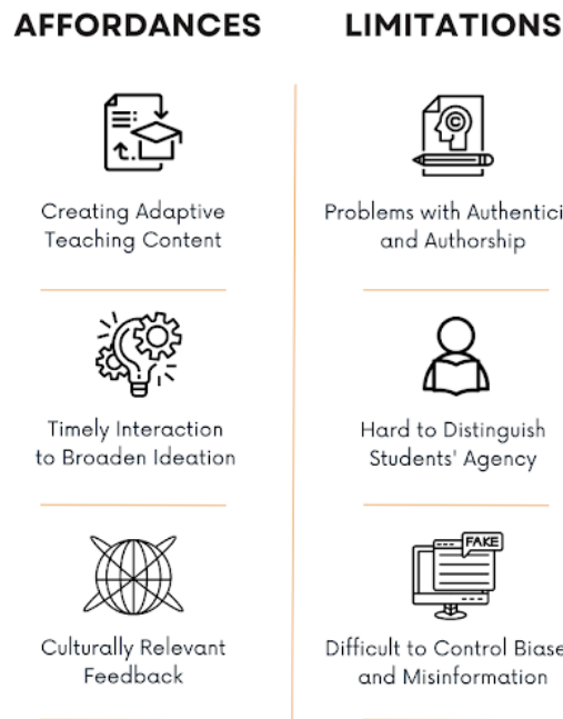
Figure 2: Summary of our findings of potential affordances and limitations of GAI systems for writing projects in elementary school settings

terms of how this affects user learning, GAI enables personalized experiences that provide immediate feedback to support the needs of diverse learners (i.e., by facilitating a real-time GAI-powered tutoring system). Further, interacting with GAI encourages students to generate ideas around topics, add details, and apply culturally relevant approaches (see Figure 2).