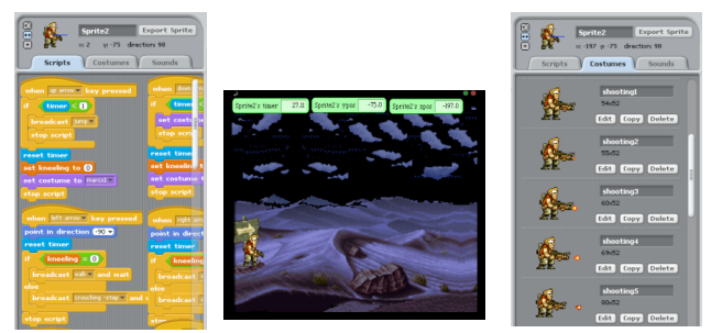
Figure 3: "Metal Slug Hell Zone X" Scratch program.

During the first 18 months of the introduction, we collected youths' Scratch projects on a weekly basis in order to track the extent to which programming concepts were taking root in the Clubhouse culture over time. We used three different data sources for our analyses: (1) the exported project summary files, which contained text-based information such as the date, file name, and author of the project as well as information about the number and types of commands that were used and the total number of stacks, sounds, and costumes used in the project; (2) weekly participant field notes that were written by a team of Undergraduate and Graduate field researchers that visited the Computer Clubhouse and supported Scratch activities at the field site; and (3) interviews with Clubhouse members about their impressions of Scratch, what it compared to, and what they knew about programming. It's important to note that the primary role of the Undergraduate and Graduate support team was to model how to learn and they were not computer scientists. The mentors had little or no experience programming and were new to Scratch [5]. In our view, this was empowered youth, allowing them to sometimes switch roles and teach a mentor something new in Scratch.