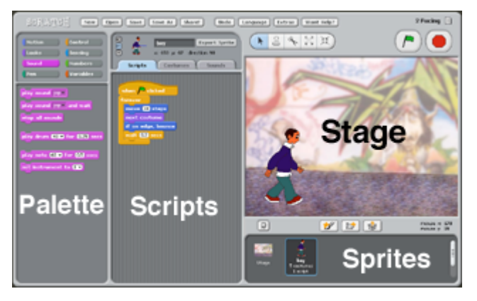
Figure 1: Screenshot of Scratch Interface

This user interface design grew out of a desire to make the key concepts of Scratch as tangible and manifest as possible. Having the command palette visible at all times invites exploration. A user who notices an interesting command can double-click it right in the palette to see what it does. A user can watch stacks in the scripting area highlight as the action unfolds on the stage. These explorations are supported by having the palette, scripting area, and stage simultaneously visible, providing the user with a process model of how their scripts are interpreted by the computer.