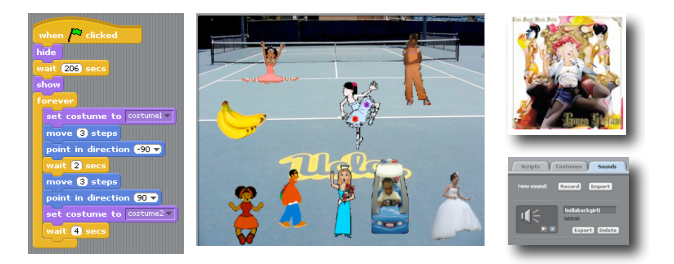
Figure 2: "k2b" Scratch program

At the time that Scratch was first introduced, programming activities were not a part of the Clubhouse portfolio of activities [6], despite the wide availability of various types of programming software. Over the course of the first two years of the project, Scratch grew to be the most widely used design software available at the Clubhouse and local programming experts emerged. We did very little to explicitly "teach" programming concepts; rather, youth worked on projects of their own choosing and requested assistance from mentors when needed. Every two or three months, we organized a Scratch-a-thon during which all clubhouse members would work on Scratch for 3-4 hours and share publicly the projects they had created. Clubhouse members used Scratch to implement various media applications ranging from video games to music videos, greetings card and animations [9]. For instance, the dance video "k2b" was created by Kaylee, a thirteen-year-old female software designer, who modeled the piece after a Gwen Stefani music video called "Hollaback Girl" (see Figure 2).